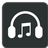
Brilliant Audio Performance