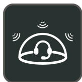
Four-Microphone Noise Cancellation

Yealink UH48 is a high-quality wired headset with ANC (Active Noise Cancellation) functionality. It is suitable for various office environments and offers a more immersive work experience.